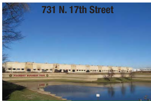
731 N. 17th Street