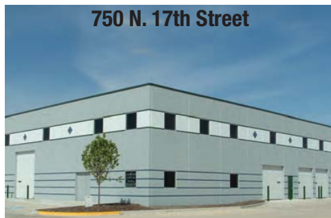
750 N. 17th Street