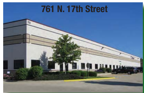
761 N. 17th Street