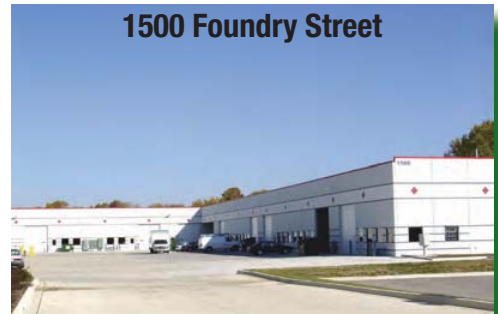
1500 Foundry Street