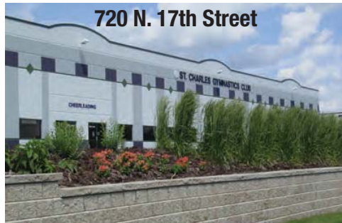
720 N. 17th Street

LINDA HELMOLD RIPPER, MANAGING BROKER 630-878-8387