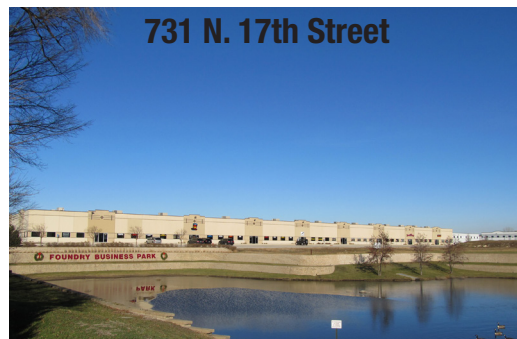
731 N. 17th Street