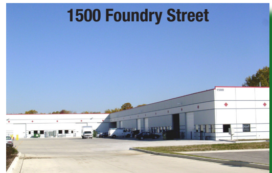
1500 Foundry Street