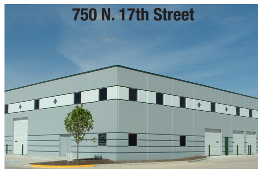
750 N. 17th Street