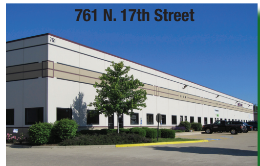
761 N. 17th Street