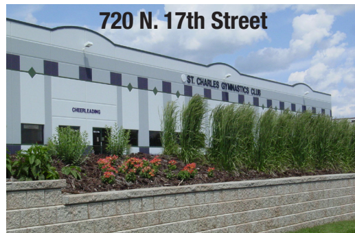
720 N. 17th Street

LINDA HERMOLD RIPPER, MANAGING BROKER 630-878-8387